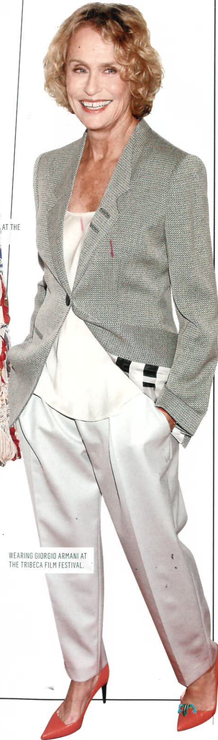
WEARING GIORGIO ARMANI AT THE TRIBECA FILM FESTIVAL.

OCCUPATION: Co-founder and creative director of Moda Operandi. RESIDENCE: New York City. FAVORITE DESIGNERS: "Proenza Schouler, Gucci." FAVORITE PLACE TO SHOP: "Moda Operandi, of course." FAVORITE SHOES: "Rochas." FAVORITE PIECE OF JEWELRY: "My wedding band."