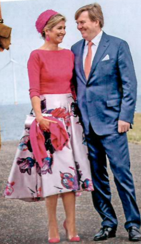
KING WILLEM-ALEXANDER IN A GRAY SUIT AND QUEEN MÁXIMA IN A ZIMMERMANN DRESS DURING A STATE VISIT TO ITALY. RIGHT, WEARING NATAN AND A BLUE SUIT IN THE NETHERLANDS.