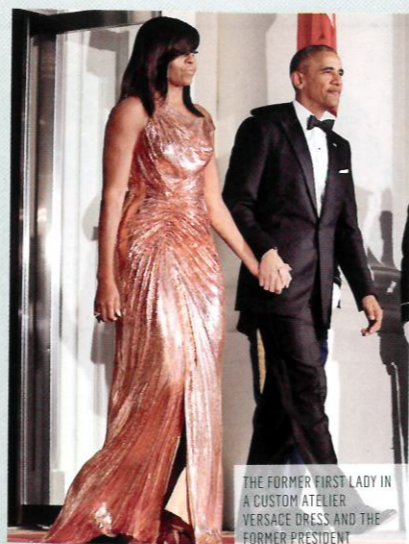
THE FORMER FIRST LADY IN A CUSTOM ATELIER VERSACE DRESS AND THE FORMER PRESIDENT IN A TUXEDO; BELOW, WEARING A CUSTOM VERA WANG DRESS AND BLACK-TIE.