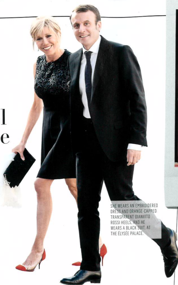
SHE WEARS AN EMBROIDERED DRESS AND ORANGE-CAPPED TRANSPARENT GIANVITO ROSSI HEELS, AND HE WEARS A BLACK SUIT, AT THE ÉLYSÉE PALACE.

OCCUPATIONS: President of France; retired schoolteacher. RESIDENCE: Élysée Palace, Paris. HER NOTABLE DESIGNERS: Louis Vuitton, Balmain, Alexandre Vauthier. MOST MEMORABLE LOOKS OF THE YEAR: A navy suit for him, and a powder-blue dress and matching military-style jacket by Louis Vuitton for her, worn to Macron's inauguration.